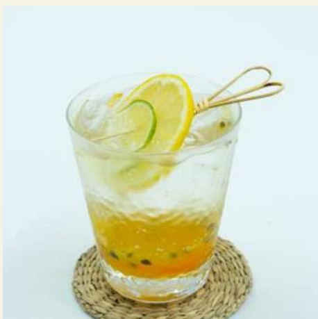
815 Passionfruit Soda 百香苏打 4.2