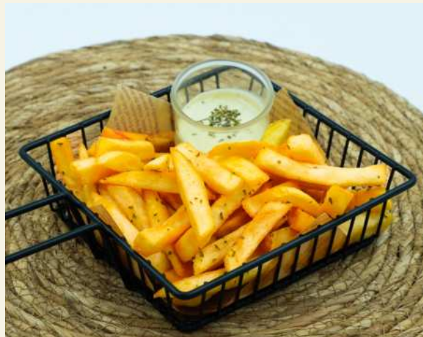
3000 Truffle Sea Salt Fries 松露海盐薯条 9.9