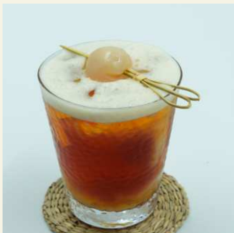
808 Iced Lychee Black Tea 荔枝红茶 4.2