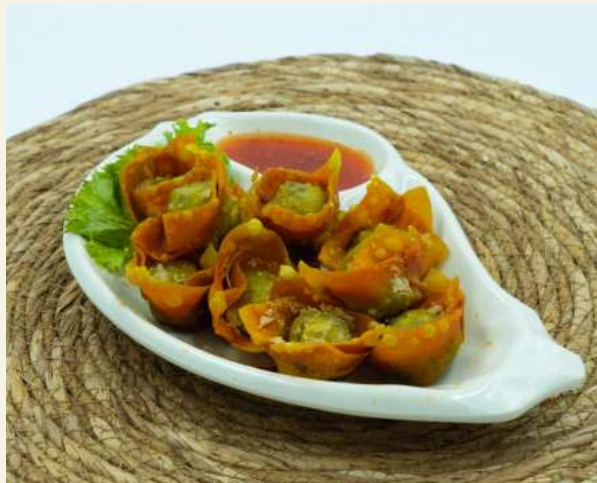
3001 Fried Wonton (10 pcs) 招牌炸云吞 7.9