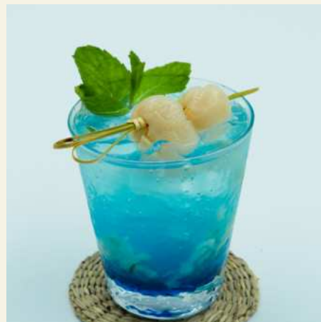
814 Blue Sky Soda with Longan 蓝色海洋 4.2